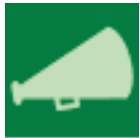
Freedom of Speech