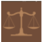
Due Process & Justice

The subject is up to you, but some possible topics include: