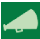
Freedom of Speech