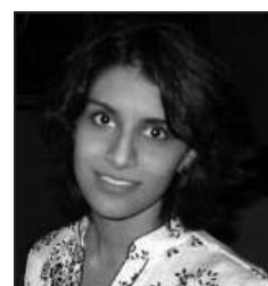
Become an NYCLU E-Activist. Visit www.nyclu.org .

I guess it's selfish but it is making friends with NYCLU members. The ones I've met so far are motivated, thoughtful, and still feel empowered enough to try for change. They're the ones who don't give up. 🐼