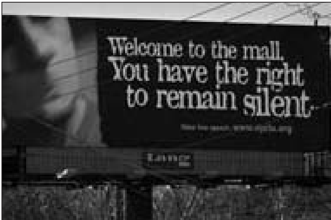
The NYCLU posted this billboard outside an Albany-area mall after a customer was arrested for wearing an anti-war T-shirt. The billboard then became the subject of investigation.

Two weeks later, after additional advocacy by Gewanter and Faiella, a statement was broadcast over the school's public address system assuring students that they may display controversial or political messages, including messages supportive of lesbian, gay, bisexual and transgender people. The school district also issued Farnham a private apology.