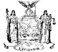
JULIA SALAZAR State Senator 18 th Senate District